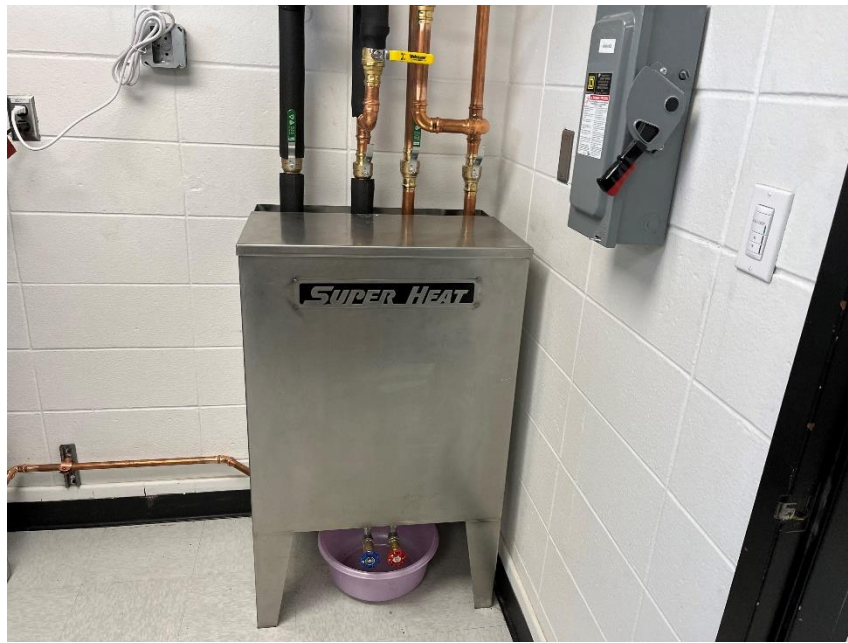
Filters for Glycol – Cold pipes sweating